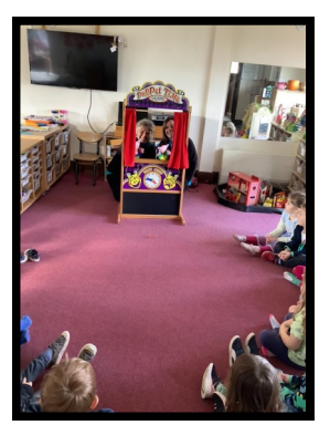
Puppet Show Time!