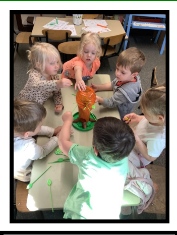
Showing good turn taking skills by playing a game together.