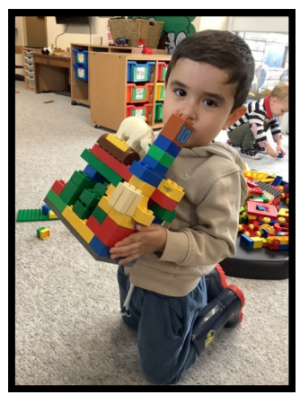
Look what I have made!