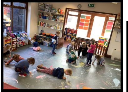
Using the Large chalks practice our mark making skills.