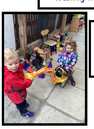
Having fun together with the Builders role play.