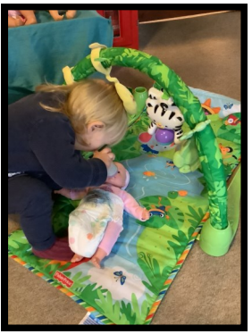
Enjoying Baby role play.