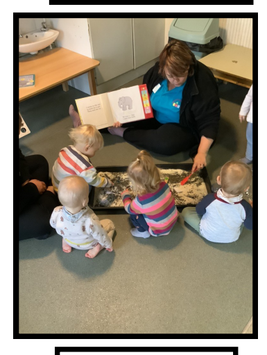
Enjoying the "Dear Zoo "sensory tray.