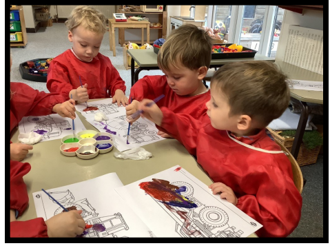
Using the small paint brushes to create our pictures.