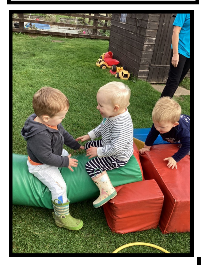
Having fun together on the soft play.