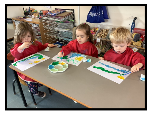
Creating our five little Ducks pictures.