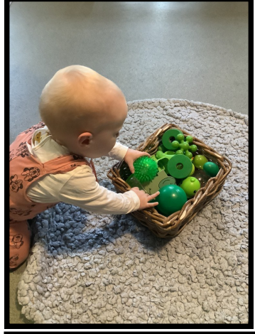
Exploring the green sensory basket.