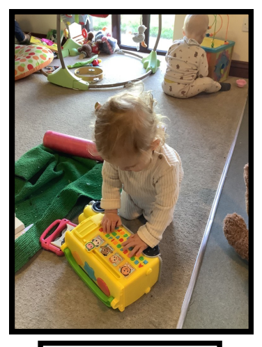
Exploring the ICT toys.