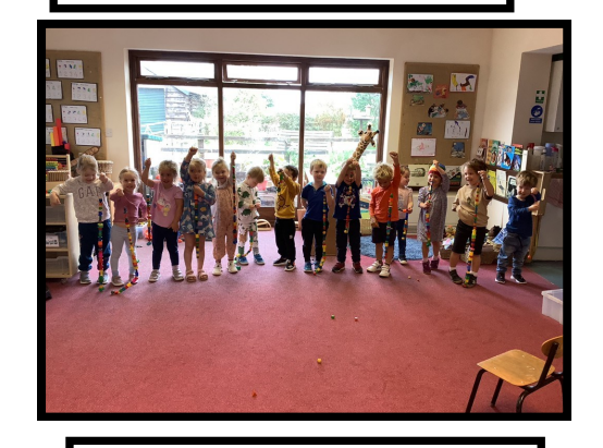
Completing our threading challenge