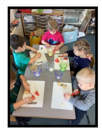
Cutting our fruit for our snack.