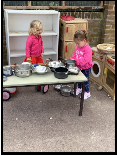
Cooking up some treats in the outside kitchen.