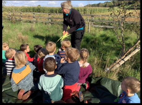
We spotted the Forager in the field so went to see it working.