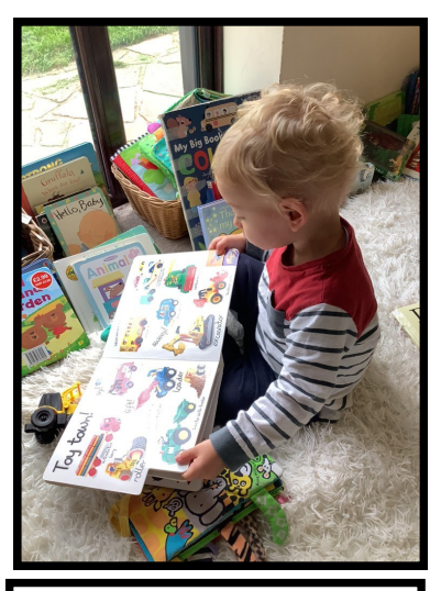
Choosing a book of interest.