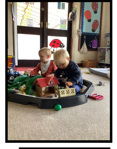
Enjoying the Farm small world.