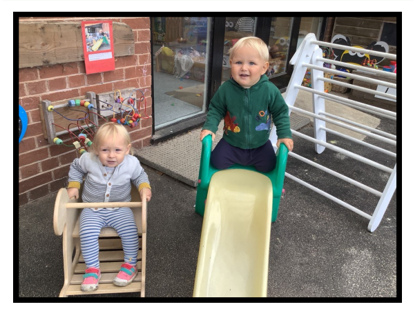
Having fun in the free flow.