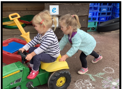
Giving my friend a helping hand!