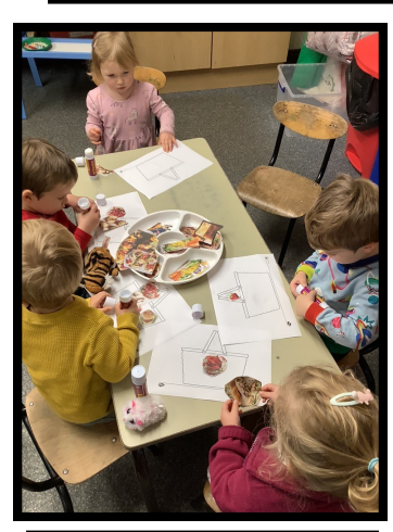
Creating our Picnic Baskets.