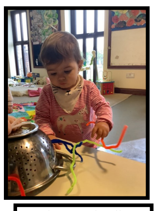
Pushing and pulling Pipe cleaners through the colander.