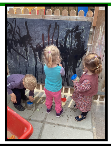
Mark making with water and brushes.