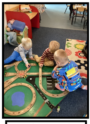
Having fun playing alongside each other.