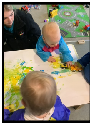
Using the vehicles and paints to create marks.