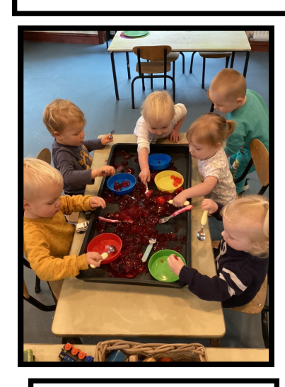
Exploring the jelly sensory tray.