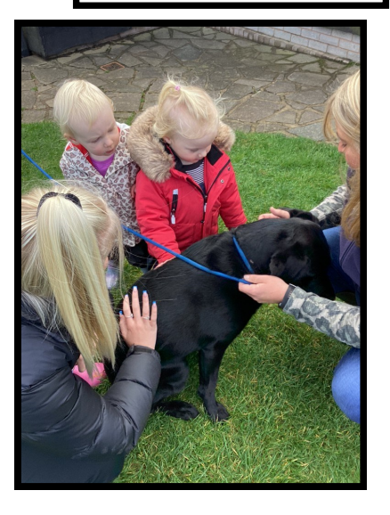
A visit from Issy's Dog Jacks .