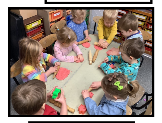
Using the rollers and cutters with our playdough.