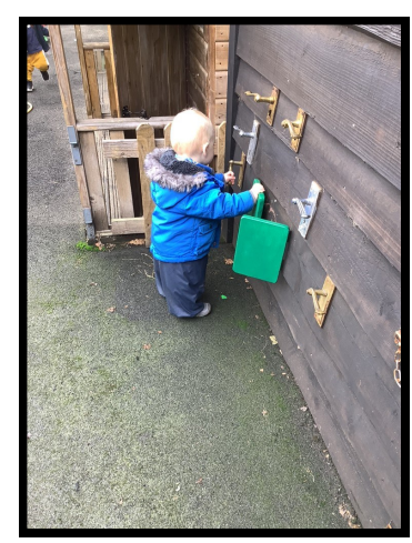
Exploring the activity wall.