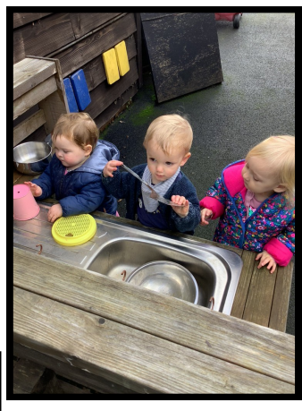
Cooking up some treats together in the outside kitchen.