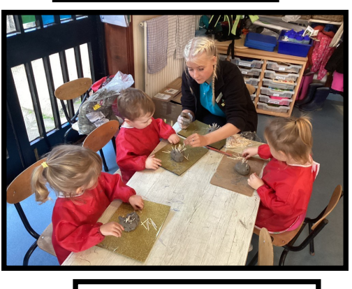
Creating Hedgehogs out of clay.