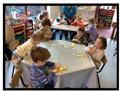
Creating our Autumn Bookmarks.