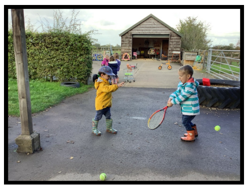
Anyone for Tennis!