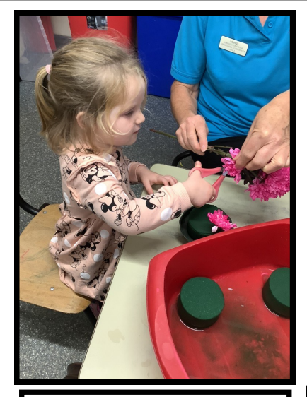
Using good scissor control to snip the stems to create a beautiful flower arrangement.